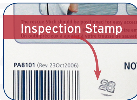
No Action Required